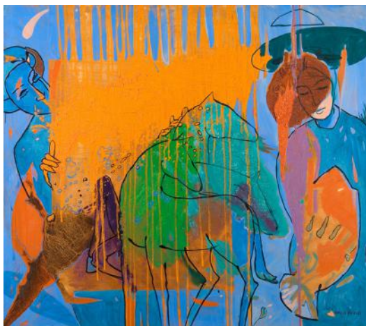
Figure 5. K. Babaev. Horses. Summer. Lovers. 2007

In the painting of Uzbekistan of the 20th century, decorative and color search always determined the main line of its development. Bold combinations of bright colors, special rhythms and understanding of the decorative principles of the composition of folk art were the basis of the innovative searches of masters of the Uzbek innovation. In their work, a concept was born, which was to be interlinked by more than one generation of painters. Therefore, it is difficult to understand the nature and originality of realism in Uzbekistan of the 20th century without taking into account the diverse national traditions and the specifics of life, which served as a source of its constant renewal.